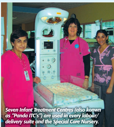
Seven Infant Treatment Centres (also known as "Panda ITC's") are used in every labour/delivery suite and the Special Care Nursery.