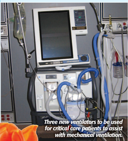
Three new ventilators to be used for critical care patients to assist with mechanical ventilation.